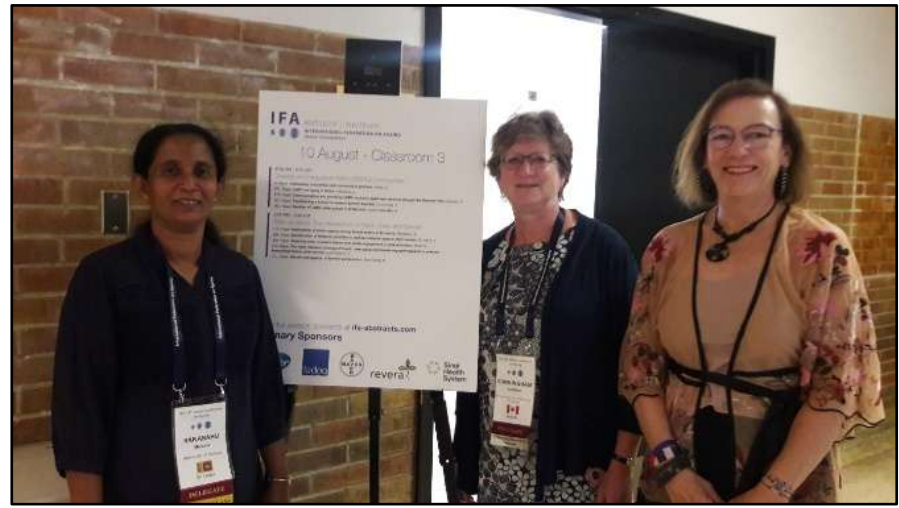
University, Toronto, Canada on 8-10 August 2018.