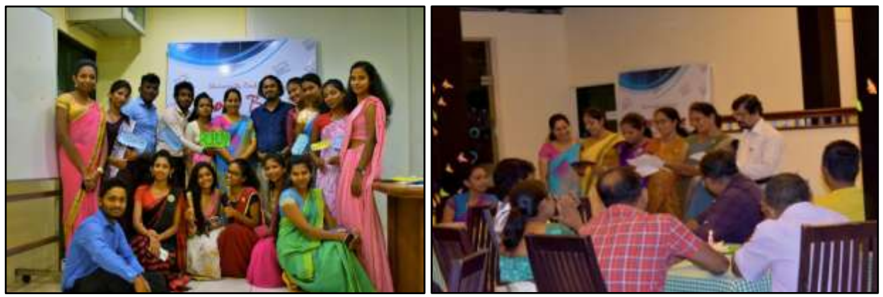
academic staff members participated in this

A farewell function for them was held at the University Guest House, University of Ruhunaon 16<sup>th</sup> of July 2018. The Head, Department of Geography and all academic and non-